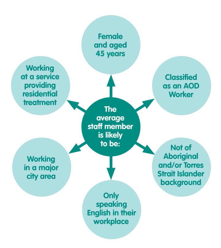
Figure 3: Key characteristics of the NSW non government AOD workforce <sup>8</sup>

Alcohol and Other Drugs Worker is the most common occupation (19.8%). The majority (82%) of staff work for an organisation providing residential rehabilitation services and 37 per cent work in a major city. Around one quarter (25.5%) work in administrative positions (i.e. administration officer/team leader/organisational manager) and 65 per cent of organisations utilise visiting or private providers (general practitioners, psychiatrists, mental health workers and other health practitioners). While most staff are employed full time (55%), 33 per cent work on a part-time basis and 12 per cent work on a fixed-term contract, casual or other basis. Key workforce characteristics are shown in Figure 3.