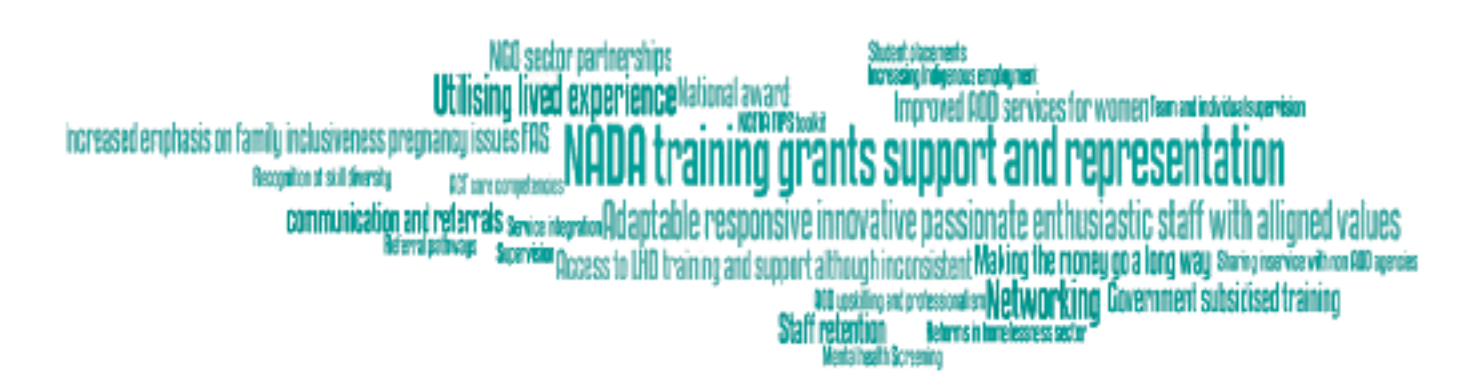
Figure 4: Key workforce development strengths of the NSW non government AOD sector