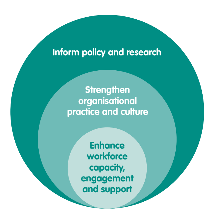
Figure 2: A graphical representation of NADA's key workforce development approaches

The Plan is underpinned by the principle of harm minimisation; that is, it seeks to enhance workforce capacity to prevent and reduce the impact of AOD-related harm on individuals, families and communities. Enhancing both specialist and non-specialist capacity to prevent and reduce AOD-related harm is a key intention of the Plan.